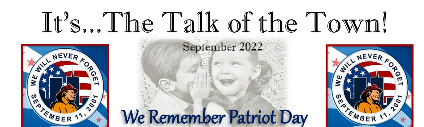
"A thoughtful mind, when it sees a nation's flag, sees not the flag, but the nation itself" - Henry Ward Beecher